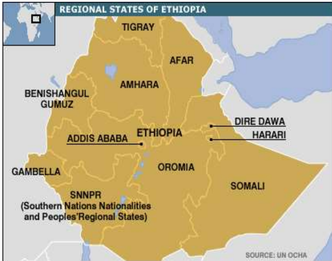
Map. 1 Ethiopia: Ethnically Defined Administrative Regional States